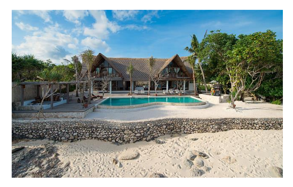
Located on <u>Nusa Lembongan just 30 minutes from Bali</u>, Villa Voyage is a five-bedroom luxury villa right on the beachfront.

If you fantasize being castaway lovers, Villa Voyage is your chance to experience private island life without the million-dollar price tag.